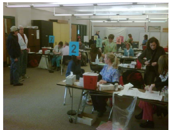
Vaccination stations in the Media Room.